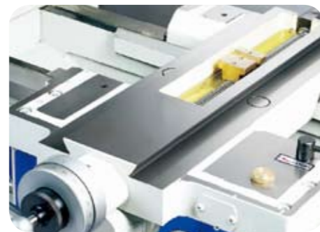
Reservoir Oil Bath Type Cross Slide (S series)