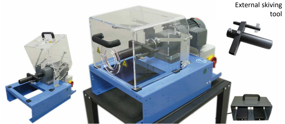
NSK 50 Electric Skiving Machine External and Internal Options : Simultaneous Internal and External skive Clamping Device Reverse Skiving for wire braided hoses