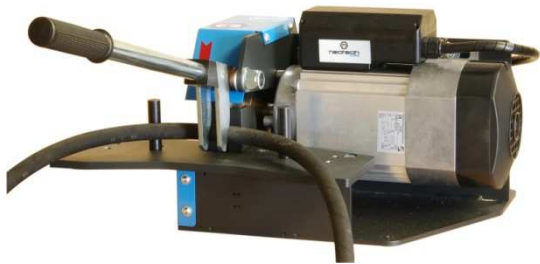
NC25 1" 4-SP & 2" Industrial 2 kW – 220V 1-PH BRAKE MOTOR HSS Disc 210mm

ALL OUR HOSE CUTTERS ARE EQUIPPED WITH A BRAKE MOTOR HIGHEST SAFETY STANDARDS