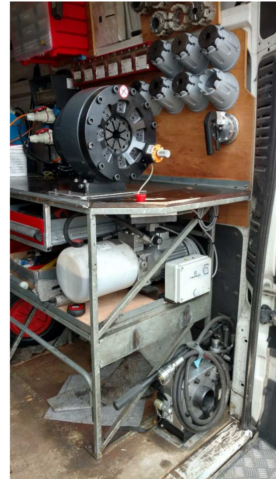
NKS-40 220V + NKS16-HP in van

NKS models are also available in 400V 3PH, 220V 1-PH or 110V 1-PH. NKS60 models are available on request