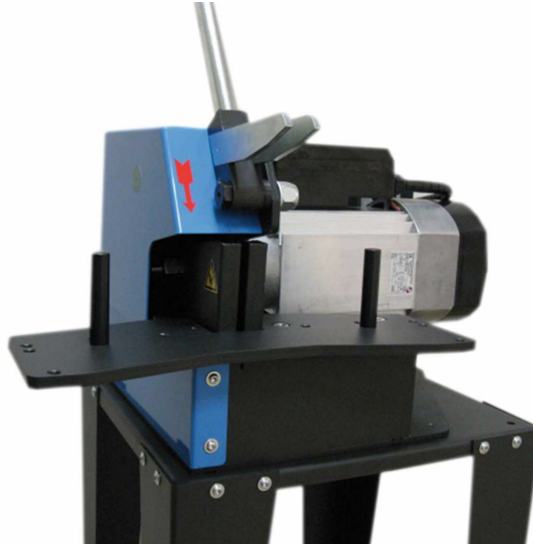
NC30 1 1/4" 4-SP & 2" Industrial 4 kW – 400V 3-PH BRAKE MOTOR HSS Disc 275mm