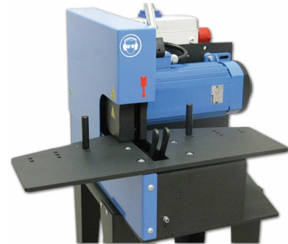
NC50 2"6-SP & 3" Industrial 5 kW – 400V 3-PH BRAKE MOTOR HSS Disc 400mm Force amplifier for an easy cut