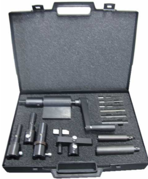
NSK 1 Manual Skiving Set Kit 1 ¼" or 2" External and Internal